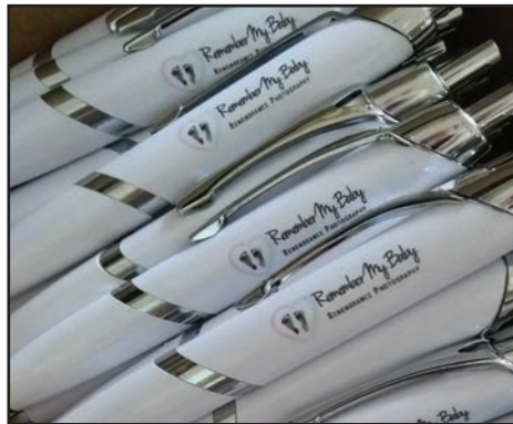
Remember My Baby Branded Pens