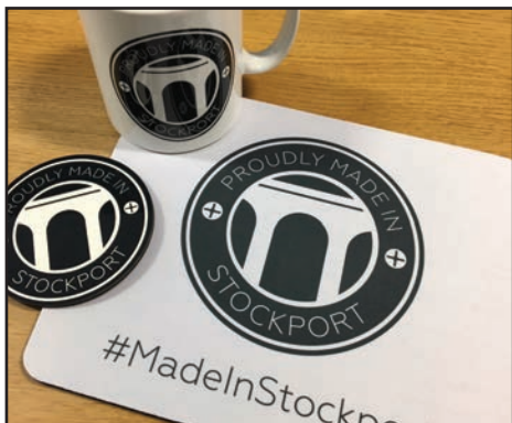
'Made In...' Promotional Items