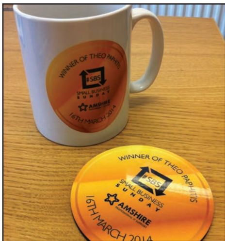
Theo Paphitis #SBS Winner Goodies

Want to give your customers something memorable? Promotional items can be used to promote the business and show off.