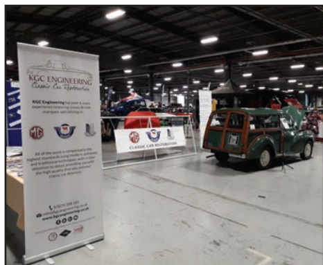
KGC Engineering Roller and PVC Banners

Want to show make an exhibition of your small business? There are a variety of items you could utilies to promote your business.