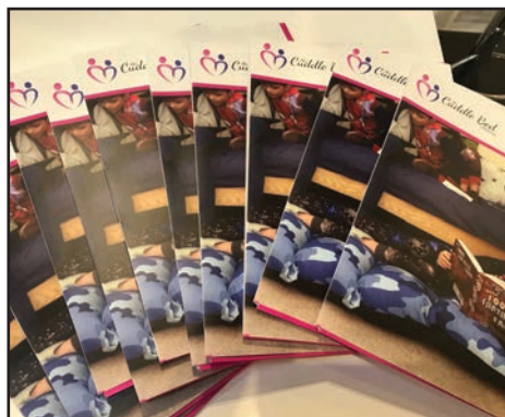
The Cuddle Bed Company Folders