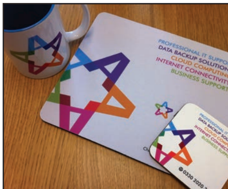
Amshire Solutions Ltd. Promotional Items