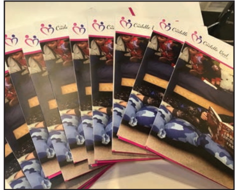
The Cuddle Bed Company Folders