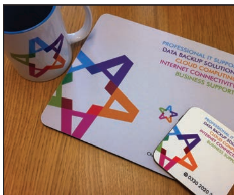
Amshire Solutions Ltd. Promotional Items