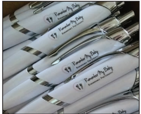
Remember My Baby Branded Pens