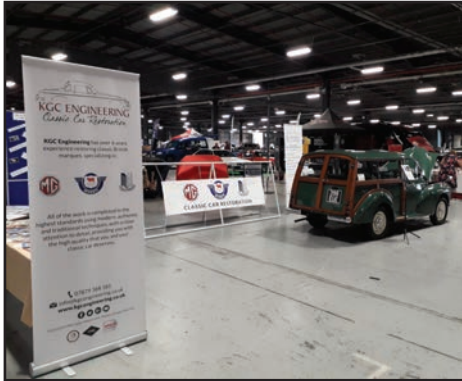
KGC Engineering Roller and PVC Banners

Want to show make an exhibition of your small business? There are a variety of items you could utilies to promote your business.